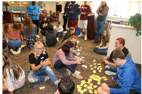
Local Students in a Break-Out Session

Each year the MOISD “sponsors” the Project Outreach collaborative, with all six of the local high schools.