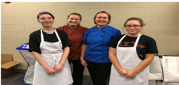
Career Center Culinary Team