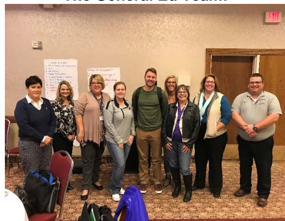
Local Teams at the MAS/FPS Conference