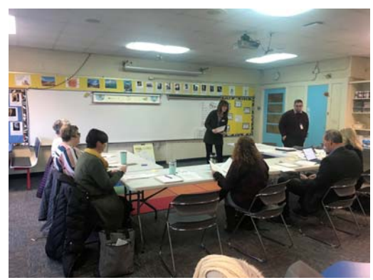
Rounds beginning at Mecosta Elementary

members of the teams that are conducting the "School Renewal Rounds" as part of the initial stage of the HIL project.