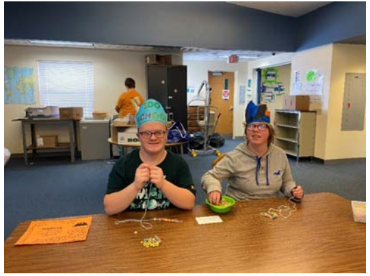
Students strung 100 fruit loops!

We celebrated 100's Day on Wednesday, February 5<sup>th</sup>! Students had the opportunity to rotate through classrooms and participate in fun 100's Day based activities. Some of those activities included 100 exercises, building with 100 things, and making a 100 Day crown!