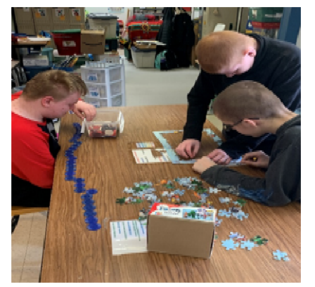
Students put together a 100 piece puzzle!