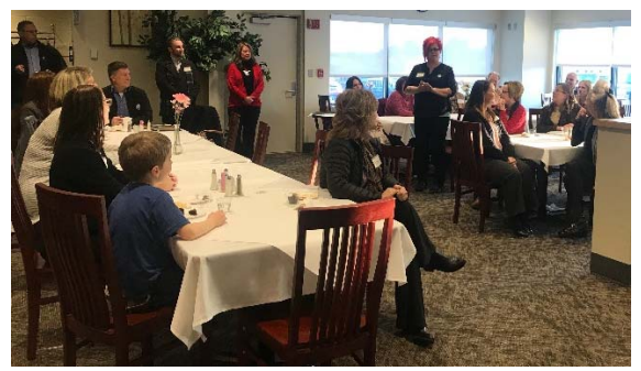
The Starting Place Restaurant was nearly full with guests for Business After Hours

The networking with our community's business leaders was priceless for our staff members. Additionally, we were able to share all the amazing opportunities for students in our CTE programs. Several of our guests are MOCC alumni and couldn't believe how the programs have evolved and were thoroughly impressed with all that we have to offer.