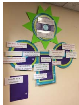
Learning Targets for Transition I