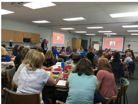
Local Elementary Teachers-Essential Early Literacy

locals, learned about small group instruction assessment practices. Due to the commitment from Morley, we will be holding our next learning on their campus, with teachers from all the locals still being welcome to attend.