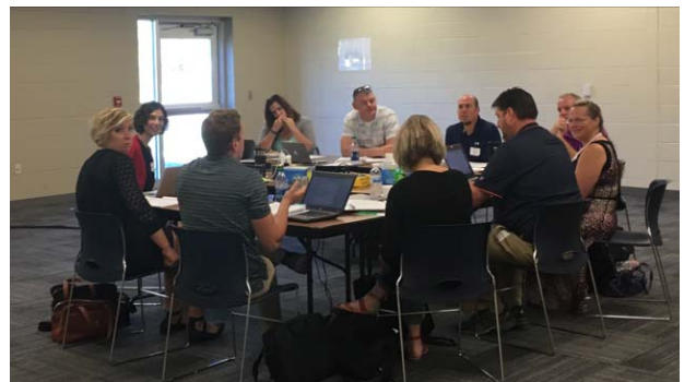
The Montcalm team discusses PBIS implementation with their MIBLSI coach

MIBLSI - Our partnership with Chippewa Hills and MIBLSI is under way with the District Implementation Team meeting on September 25. MOISD is now the regional hub for MIBLSI and the team from Montcalm is also joining us to work with their coach from MIBLSI. This allows for great collaboration and idea sharing when other teams are navigating the MIBLSI structure together.