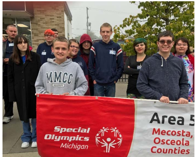
Transition II students cheer on the annual Torch Run downtown Big Rapids in support of Special Olympics

Both classrooms participate in a Transition Community Living Experience (TCLE) which provides training for our transition students to learn job skills which hopefully will lead to future employment and/or volunteer opportunities at similar job sites. Keeping with the special education department's goal of expanding our footprint in the community, we are excited to have between 15-20 working relationships with local businesses.