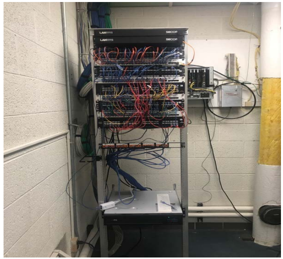
After shot of the same IDF