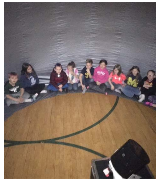
Students in the Star Lab