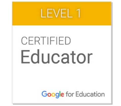
The Google Certified Educator Level 1 badge

Conference. They can now proudly display the Google Educator badge. The exam covers many of the G Suite cloud-based programs like Google Drive, Gmail, Google Classroom, and Google Calendar just to name a few.