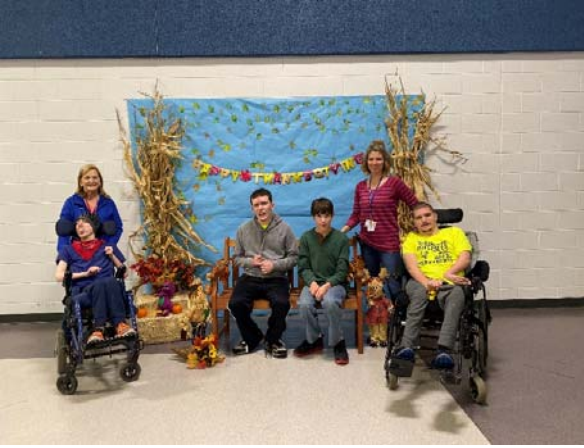
Students and staff enjoyed the fall themed photo booth!